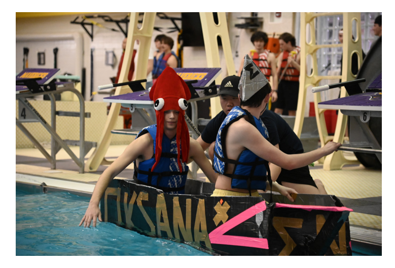
MEMBERS OF SIGMA SIGMA SIGMA AND SIGMA NU STEER THEIR BOATS DURING THE ANNUAL CARDBOARD BOAT REGATTA, AS PART OF GREEK WEEK